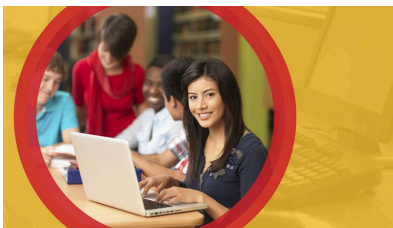
Ohio English Language Proficiency Assessment (OELPA)